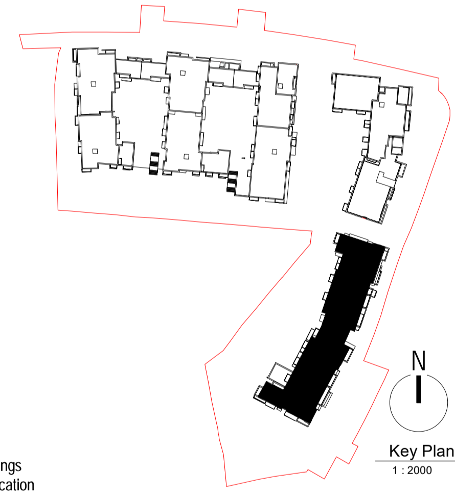
Key Plan 1 : 2000

* Refer to M&E drawings for PV Panels specification